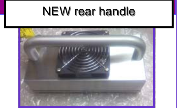
NEW rear handle