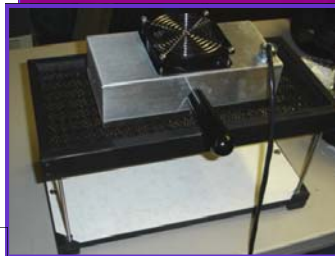
Handy holder for hot lamp!