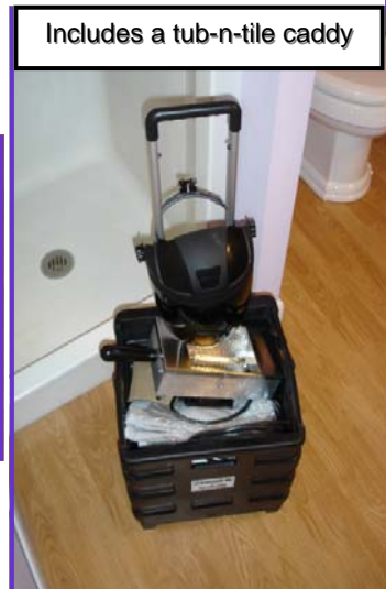
Includes a tub-n-tile caddy

The only UV equipment choice for quality refinishers of Tubs and tile